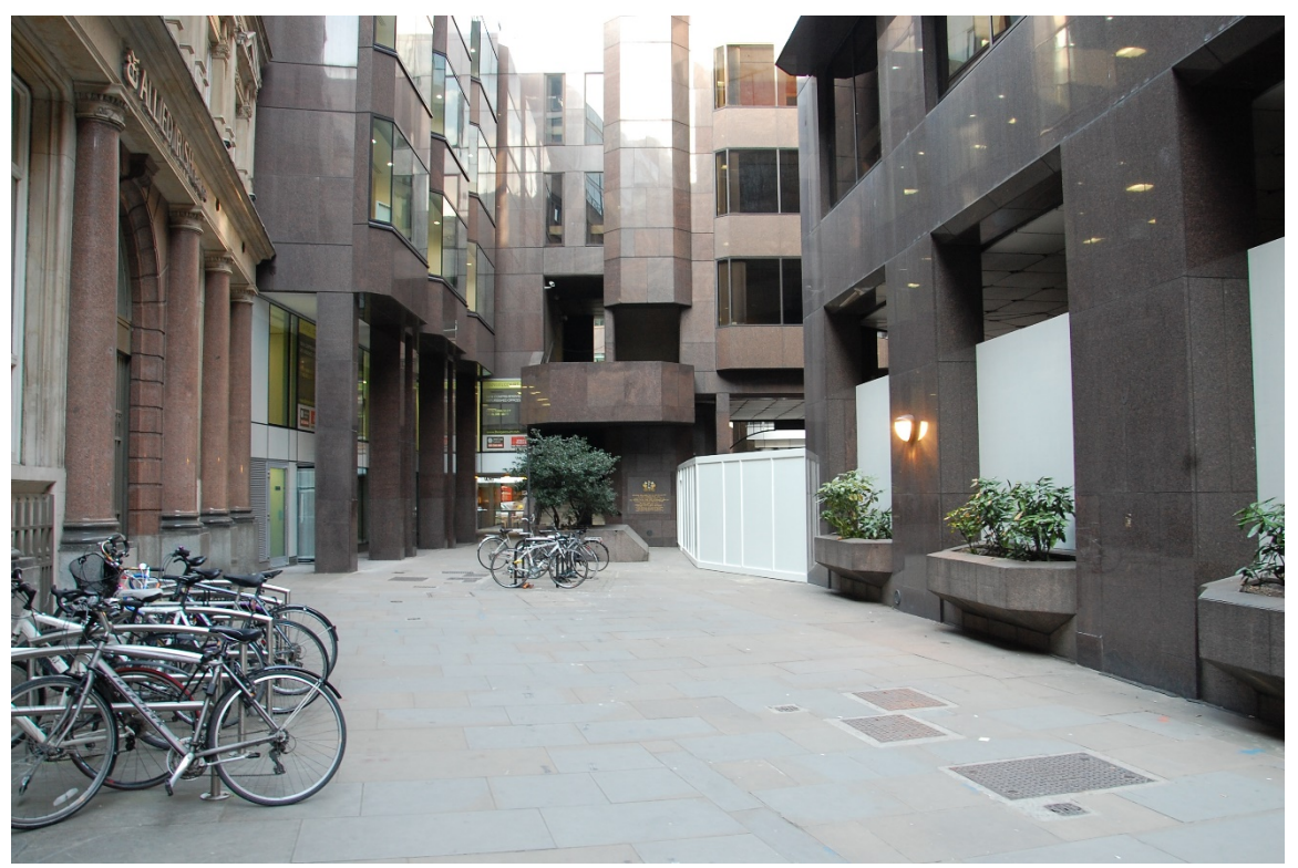
Angel Court | Before