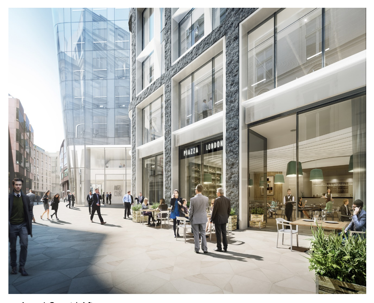
Angel Court | After